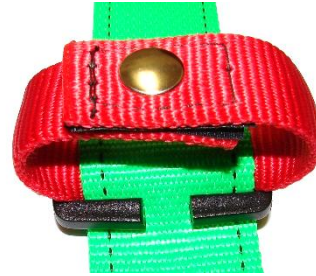
Retro Web Breakaway Loop closed

The Retro Web Breakaway Lanyard Parking Attachment must: