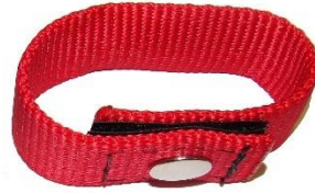
Retro Web Breakaway Loop