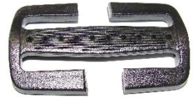
Removable Friction Buckle