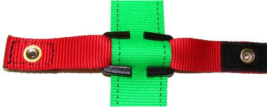
Retro Web Breakaway Loop open