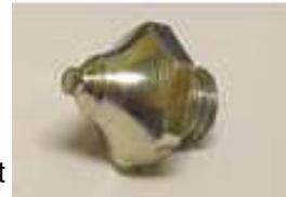
Fig. 2 P/N 483S Threaded Cleat

The Channel Handle / Cam Assembly (Fig.1) is equipped with a Threaded Cleat (Fig. 2). The Threaded Cleat, P/N 483S, is mounted into the frame of the 483D & 484T series BuckSqueeze Channel Handle/ Cam Assembly to provide enhanced gripping abilities. When installing, tighten snugly, do not over tighten.