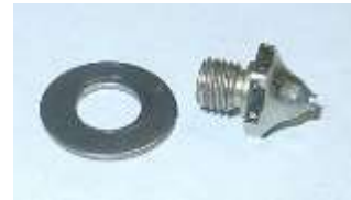
P/N 488S Fig. 1 Threaded Cleat

Note: Ensure the washer is seated on the shoulder of the Cleat (Fig. 5) and not caught under the shoulder. There should not be any space between the Cleat and the washer. (Fig.6).