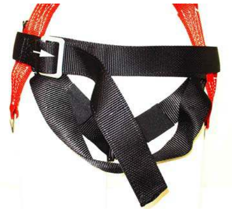
Fig. 4 Fig. 5 Fig. 6